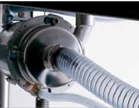
Self-draining stainless steel pump