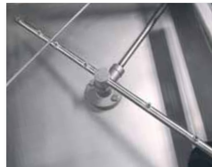
Interchangeable wash arms